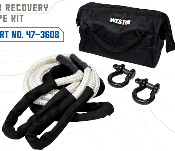
RECOVERY ACCESSORY KIT