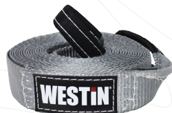
TOW STRAP (2.5" X 30')