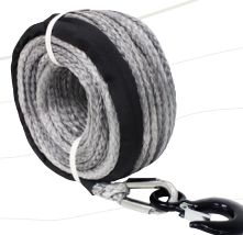
SYNTHETIC ROPE 25/64" X 94"