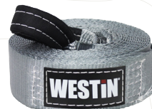
TOW STRAP (3" X 30')