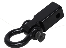
RECEIVER BOW SHACKLE KIT