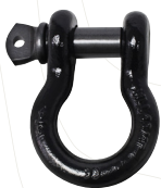
BOW SHACKLE 3/4" - RATED 9,500 LBS